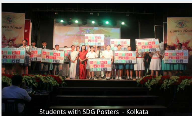
Students with SDG Posters - Kolkata