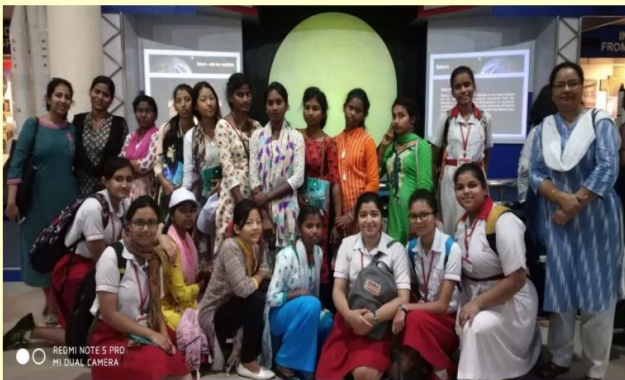
LORETO DHARAN MEETS LORETO DHARAMTALA

A special assembly was organised on the 26 th and 30 th of September 2019, to celebrate Teachers' Day. This was followed by a cultural programme which included dance, music and fashion show based on the themes 'You Can Jive' by the Juniors and 'Glimpses of India' by the Seniors.